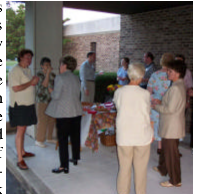
Social time together with excellent treats