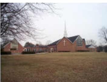
Faith Presbyterian Church

The congregation's beginnings in 1956 involved several families meeting in private homes. In 1958 Sunday services were held in the Linglestown Elementary School. The first building was dedicated