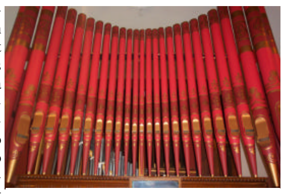
John Brown Organ Principal Facade

St. Michael Evan-Lutheran gelical Church on State Street Harrisburg founded in 1844 by a portion of the congregation of Zion Lu-Church who theran wanted to continue to worship using the German Language. During its 158 year history